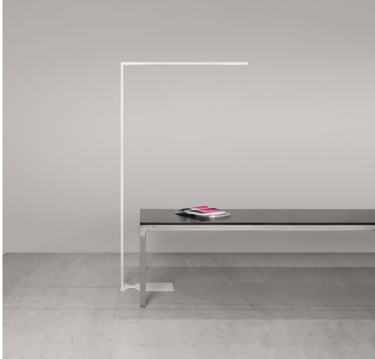
Image 3: LINETIK challenges the accepted principles of office lighting and yet still manages to simultaneously integrate perfectly into any office environment.