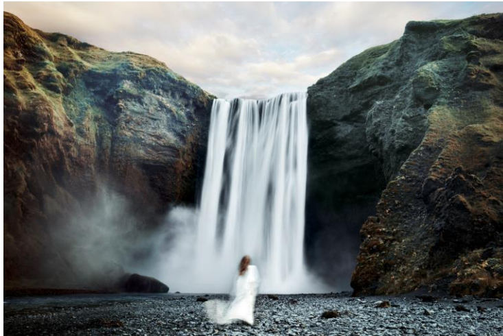
Image 1: Nothing is as vibrant as white, natural light – the role model for the dynamic and powerful emotional quality of tunableWhite.